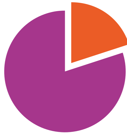
One fifth of SUDI in the UK are found to have a medical cause

Around 640,000 babies are born every year across England and Wales. Each year, approximately 300 infants under one year of age in England and Wales die suddenly and unexpectedly (SUDI), and of these, no cause is found for the deaths of approximately 230 babies (i.e. SIDS). These deaths are referred to as unexplained SUDI SIDS 3 ( www.ons.gov.uk ); death often occurs unobserved, during infant sleep, with no discernible signs of a major illness. The diagnosis is reached by exclusion, by failing to demonstrate an adequate cause of death. SIDS deaths are uncommon in the first weeks of life, peak at two - three months old with few deaths after eight months. Like other infant deaths,